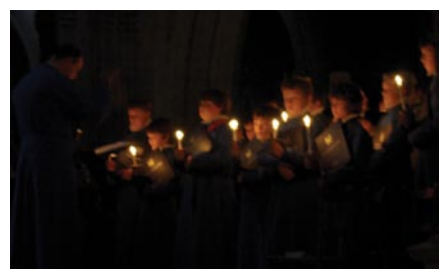
Wells Cathedral Gala Concert